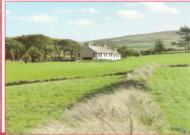
Hillside Farm (Plot) Slieau Whallian Road, St. Johns, IM4 3BJ Asking Price £599,950